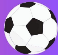
Beat the goalie!