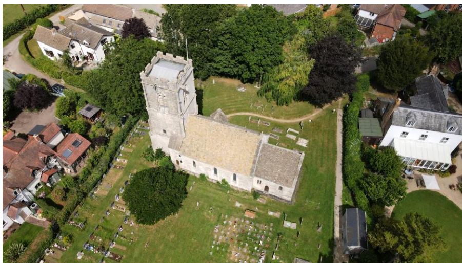
Drone's eye view of St Margaret's, July 2021