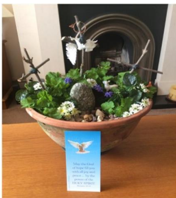
Linda Medwell's Easter garden