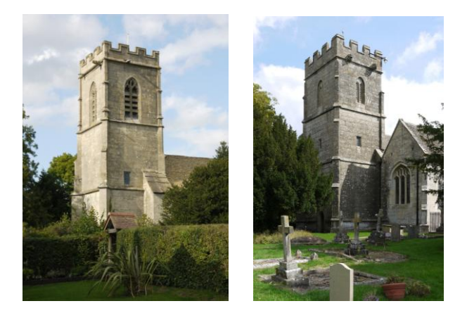
Whaddon and Moreton towers